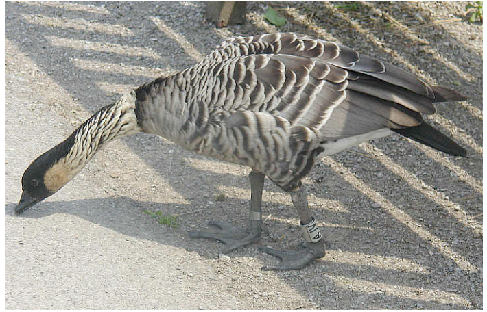
Nene – Hawaii's State Bird also known as the Hawaiian Goose.