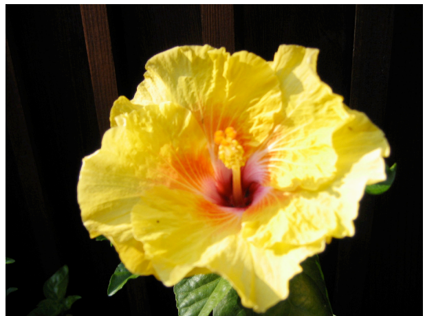
Hibiscus- State flower

Pour banana/coconut/pineapple mix slowly into the glass. The strawberry/rum mix should creep up the sides of the glass to make a wonderful looking (and tasting) summertime cocktail! from www.drinksmixer.com