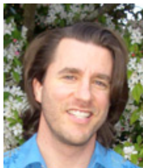
Barry Eisler - Guest of Honor