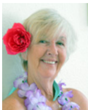
Rhys Bowen - Guest of Honor

Rhys’s mysteries have been nominated for every major mystery award, including the Edgar for best novel, and she has won seven of them. She writes three series, the Constable Evans mysteries, set in Wales, the Molly Murphy mysteries, set in turn-of-the-century New York City and the Lady Victoria Georgiana Charlotte Eugenie mysteries set in 1930s England.