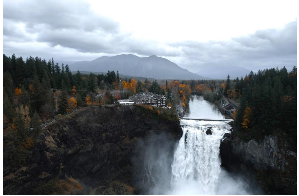
Snoqualmie Falls

You can always get <u>a damn fine cup of coffee</u> because it's easy to make a <u>Twin Peaks pilgrimage</u> to Snoqualmie, only 20 miles east of our LCC 2024 conference. Starbucks afficionados can visit <u>the first location</u> in Pike Place Market or <u>the first Reserve Roastery</u> in Capital Hill.