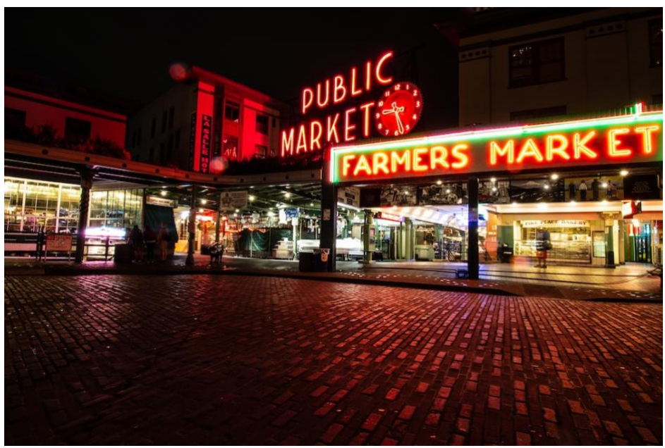
Pike Place Market

<u>Seattle Art Museum</u>, the <u>Wing Luke Museum</u> of the Asian Pacific American Experience, <u>MOHAI</u>, and the <u>Burke Museum</u> anchor the cultural heart of Seattle. The <u>Seattle Underground Tour</u> was a hugely popular part of the last LCC in Seattle, and also check out some of Seattle other quirky destinations such as <u>Seattle Pinball Museum</u>, the <u>Fremont Troll</u>, and almost <u>150 more weird and wonderful opportunities</u> to explore the Pacific Northwest.