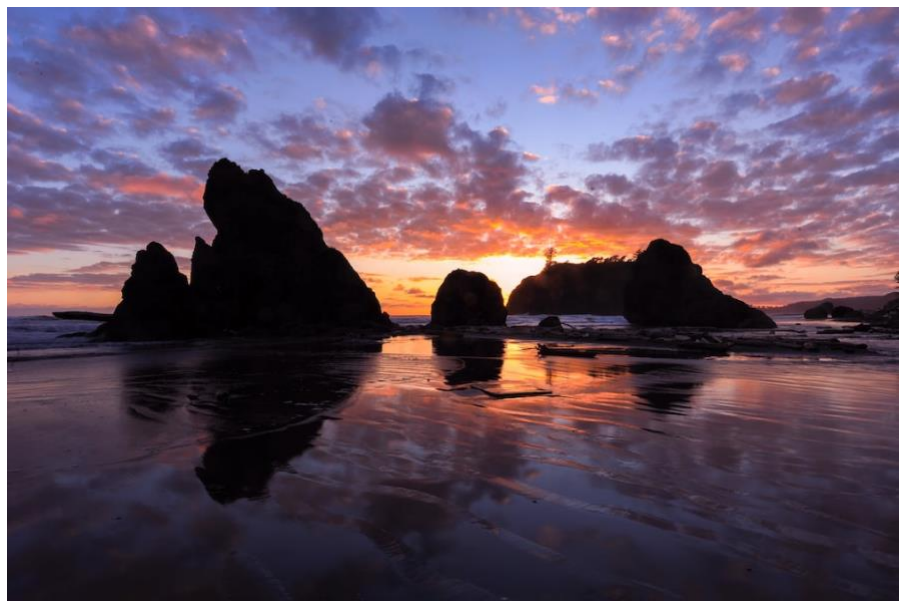
Olympic National Park

<u>Washington wine country</u> runs along Washington's <u>Columbia River border</u> with Oregon.